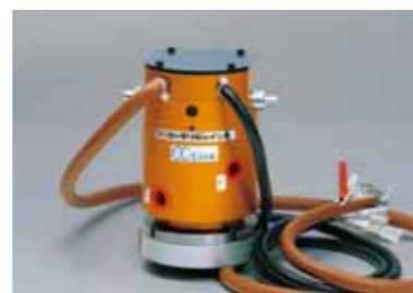
PN-ZERO 2/C-4 (CC-Link spec.)