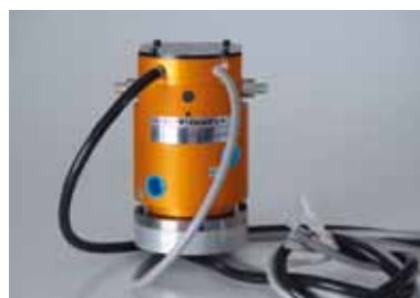
PN-ZERO 2/D-5 (DeviceNet spec.)