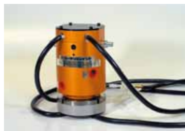
PN-ZERO 2/U-6 (Uni-wire spec.)